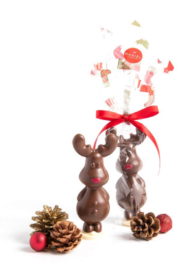
RUDOLF THE REINDEER