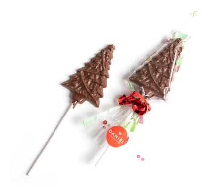
2 TREE LOLLIPOPS Milk or White, 40g