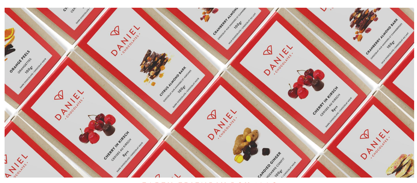
EARTH FRIENDLY BOX 100G

Orangettes | Ginger | Cherry in Kirsh | Citrus Bark | Cranberry Bark | Peppermint Bark