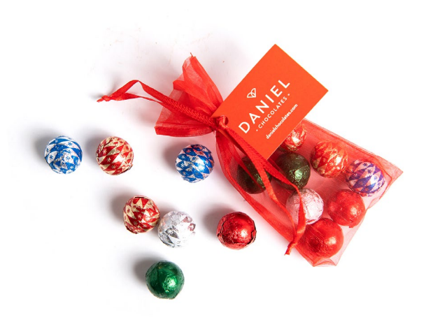
ORNAMENT ORGANZA BAG

Chocolate Ornaments Foiled, 8pcs Milk Chocolate