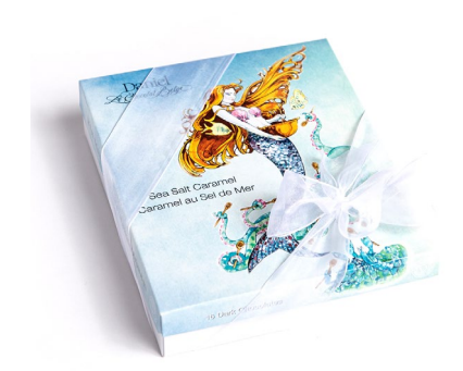
SALTED CARAMEL BOX