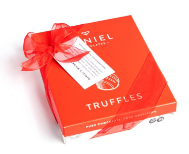
WHISKY TRUFFLE BOX

16 Whisky Truffles With Brushed Gold Powder