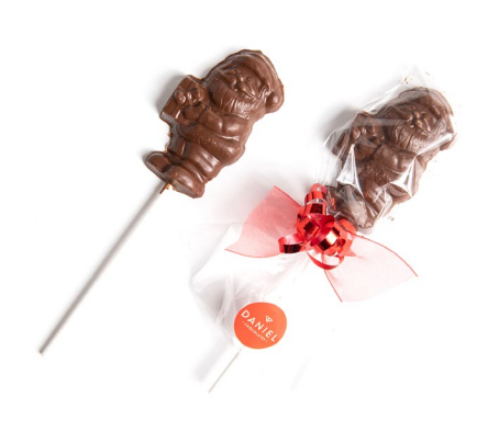
SANTA LOLLIPOP Milk Chocolate, 25g

Gingerbread Truffle | Sea Salt Caramel | Peanut Butter Truffle