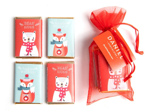
MINI BAR ORGANZA BAG 4 Mini Chocolate Bars, 9g Milk & Dark