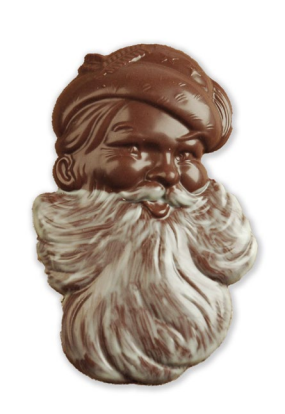
FACE OF SANTA 110G