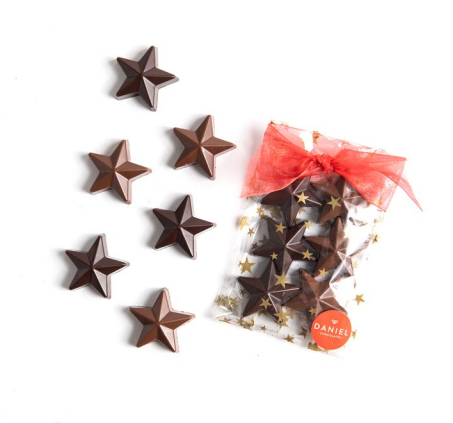
SOLID STARS Milk & Dark Chocolate, 6pcs