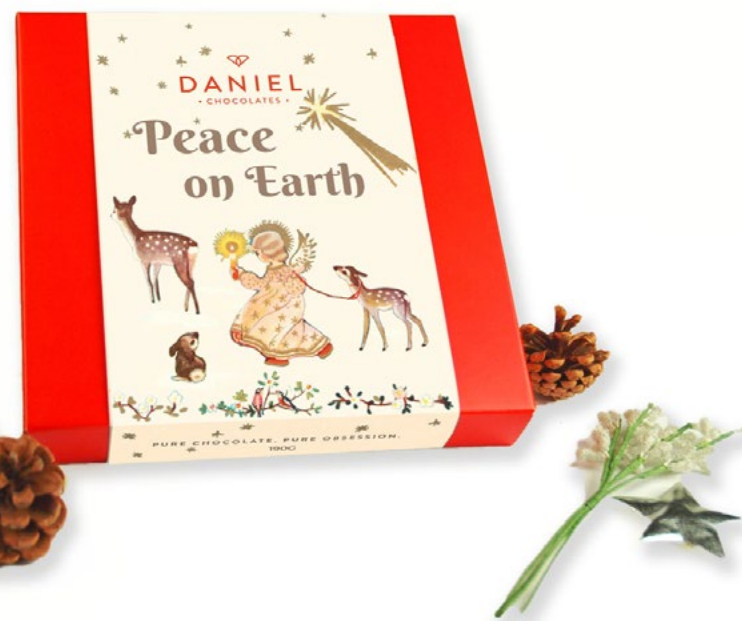
PEACE ON EARTH 22 Assorted Chocolates 22