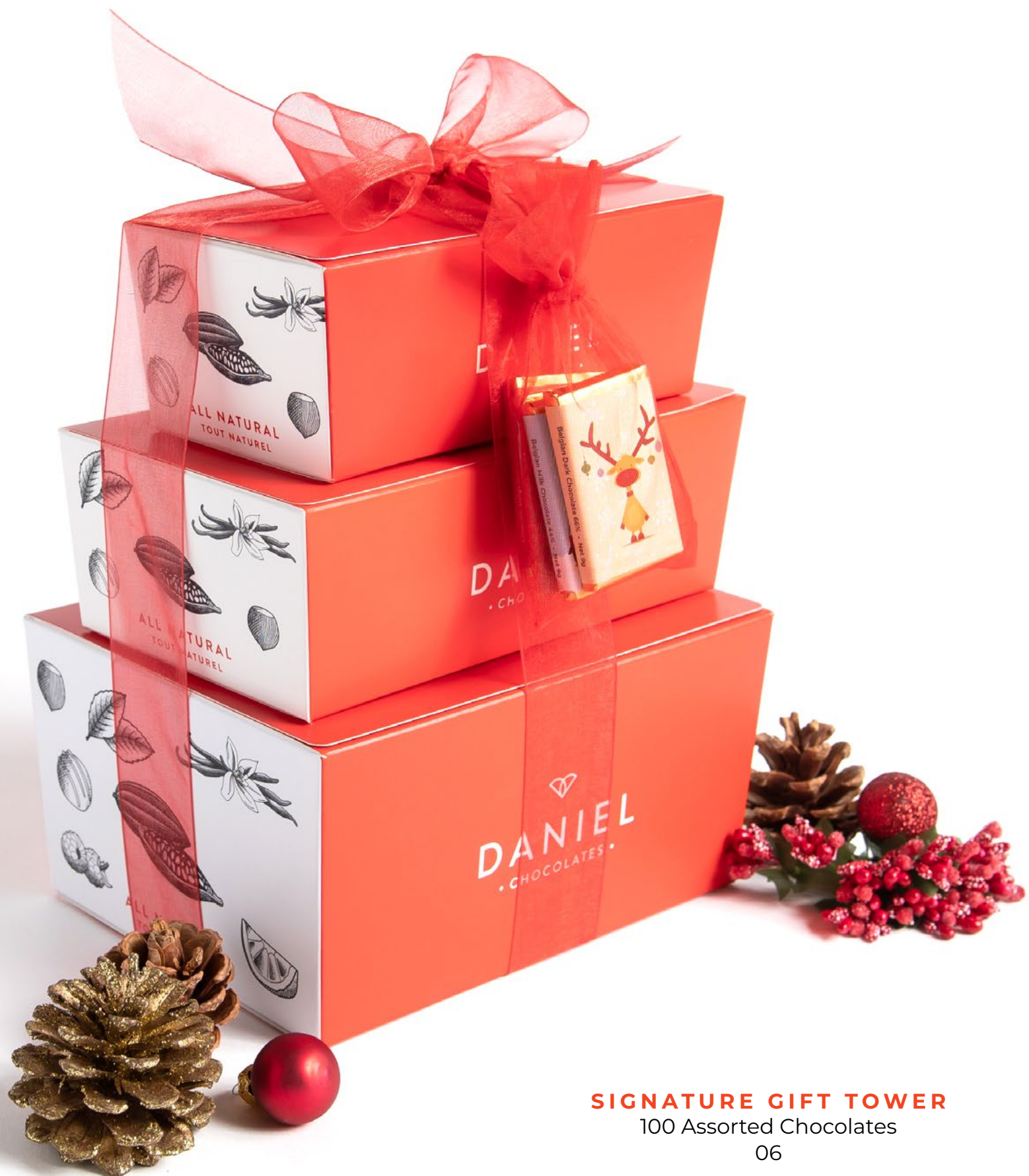
SIGNATURE GIFT TOWER 100 Assorted Chocolates 06