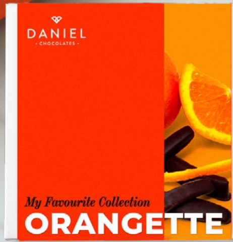
ORANGETTE 140g Dark Chocolate 15