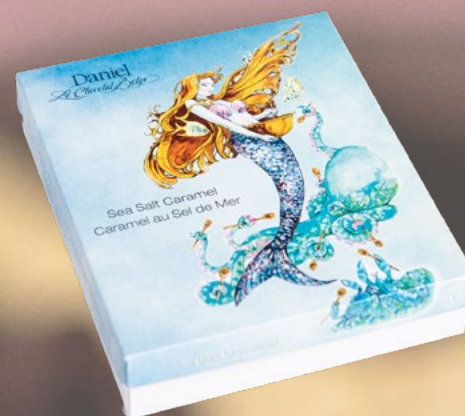
SALTED CARAMEL BOX 16 pcs Milk Chocolate 13