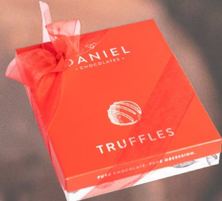
TRUFFLE BOX 16 Assorted Truffles 12