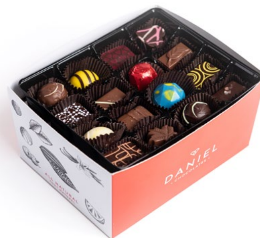
SIGNATURE BOXES 52 assorted filled chocolates 05