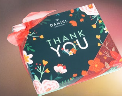
THANK YOU BOX 16 Assorted Chocolates 14