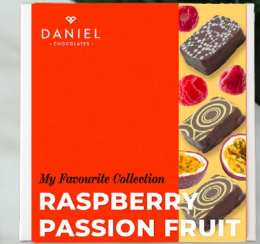
RASPBERRY PASSION FRUIT 3 pcs Raspberry 9 pcs Passion Fruit 18