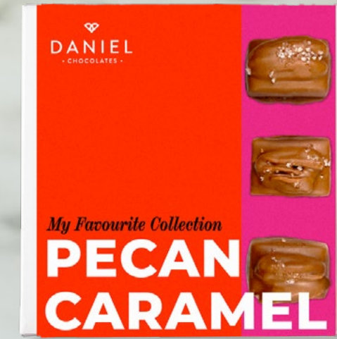
PECAN CARAMEL 12 pcs Milk Chocolate 16