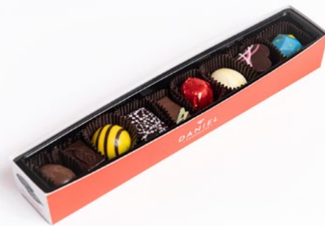
SIGNATURE BOXES 10 assorted filled chocolates 01