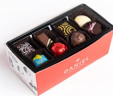
SIGNATURE BOXES 18 assorted filled chocolates 02