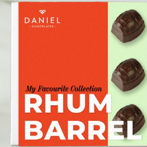
RHUM BARREL 12 pcs Dark Chocolate 17