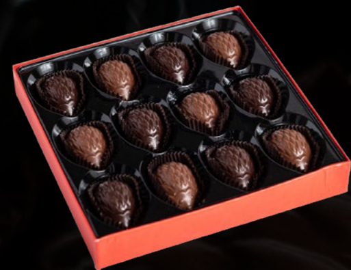
HEDGEHOG BOX 12 Hedgehogs, Milk & Dark 10