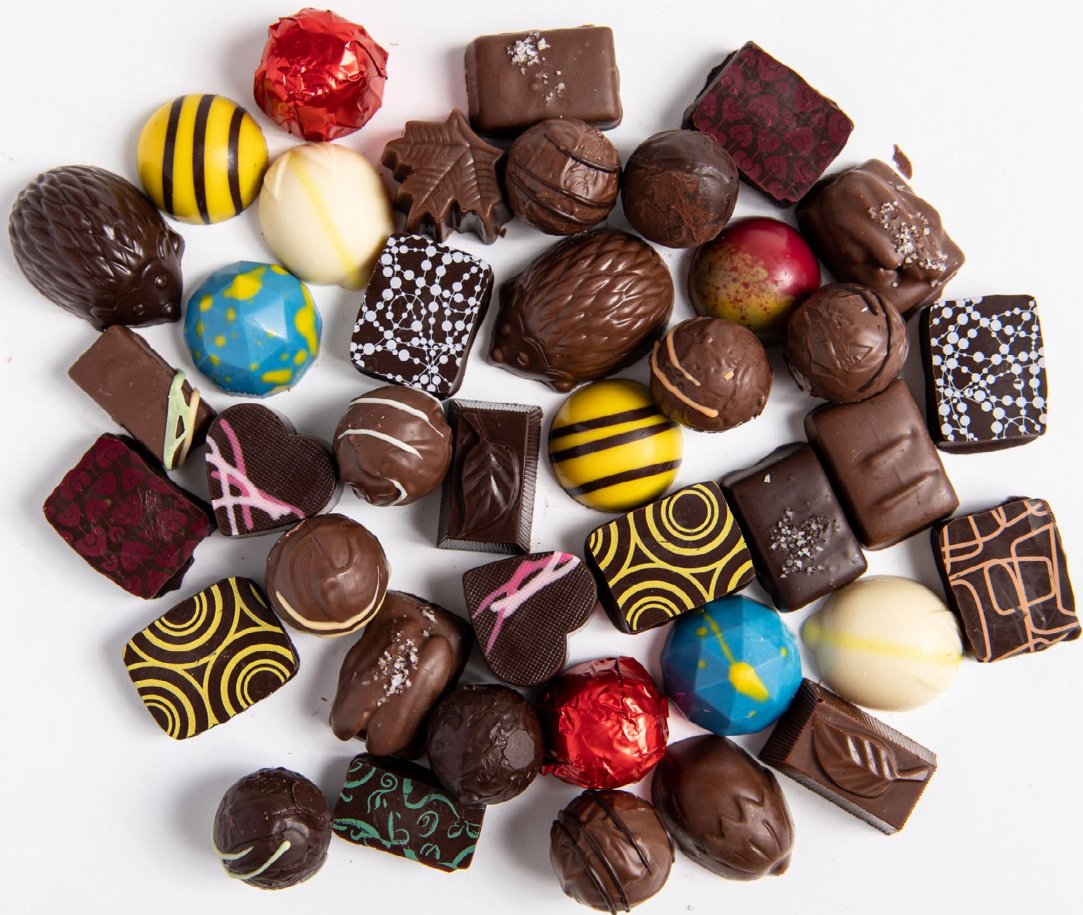
Chocolate Map Christmas edition