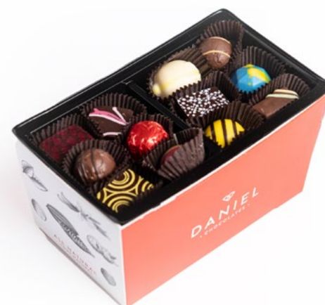
SIGNATURE BOXES 36 assorted filled chocolates 04