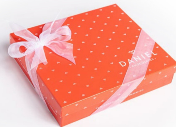
LA MAGNIFIQUE 88 assorted filled chocolates 09