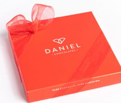
CLASSIC BOX 22 assorted filled chocolates 07