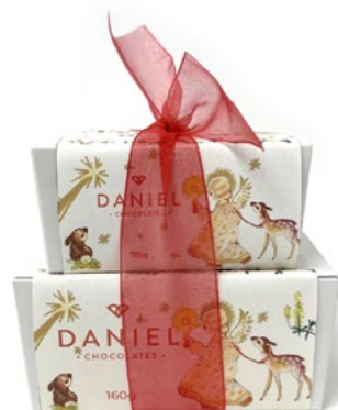
PEACE ON EARTH Peace on Earth 12 pcs 23 Peace on Earth Mini Tower 24