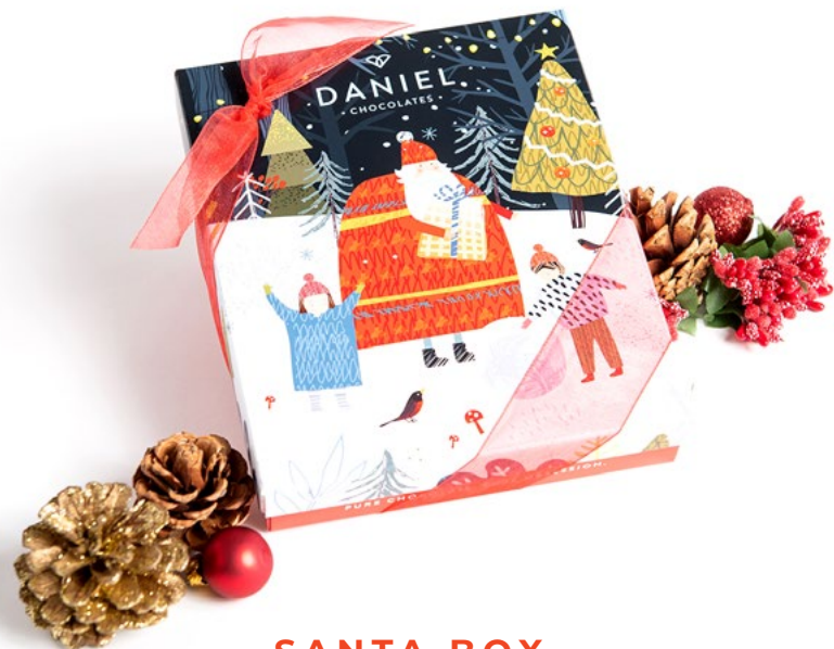
SANTA BOX 16 Assorted Chocolates 19