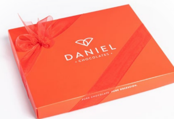
CLASSIC BOXES 44 assorted filled chocolates 08