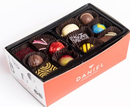
SIGNATURE BOXES 26 assorted filled chocolates 03