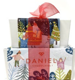
SANTA & KIDS Santa & Kids 12 pcs 20 Santa & Kids Mini Tower 21