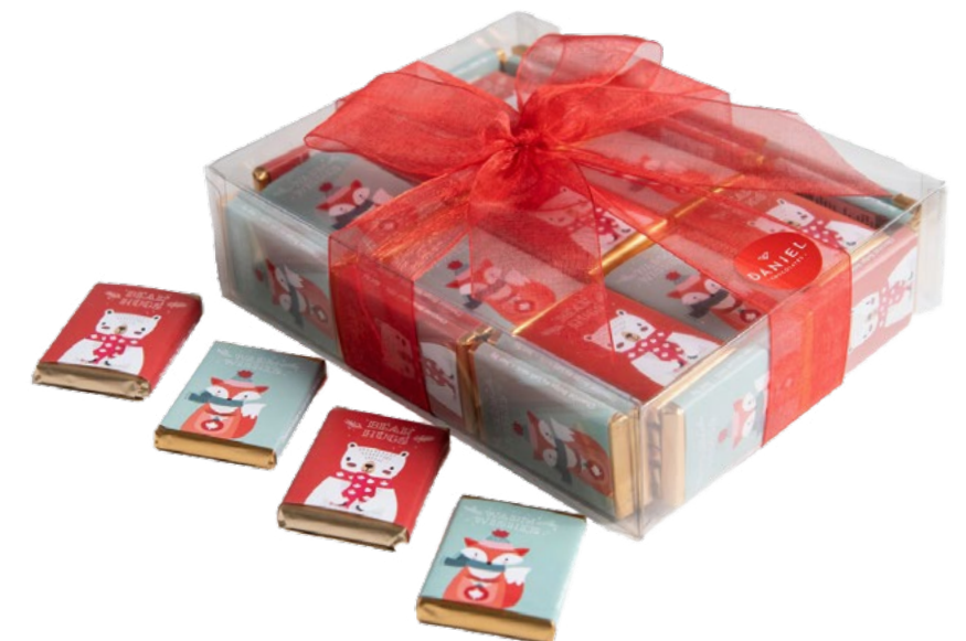
BOX OF 60 CHRISTMAS MINI BARS 60 Mini Chocolate Bars, 9g Milk & Dark 26